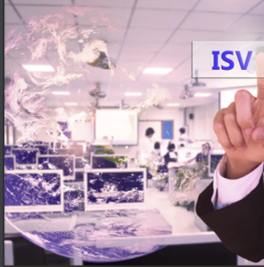
Decision-Based Costing Software Vendors IG